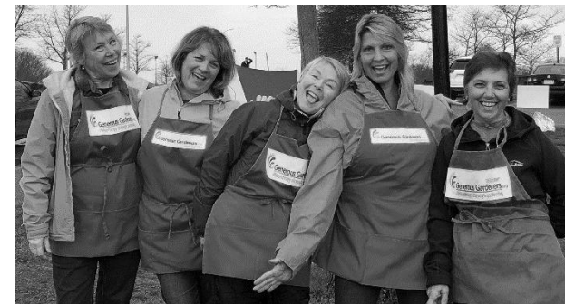
Generous Gardeners brave the weather!

Create an online giving page at GloucesterPrideStride.com